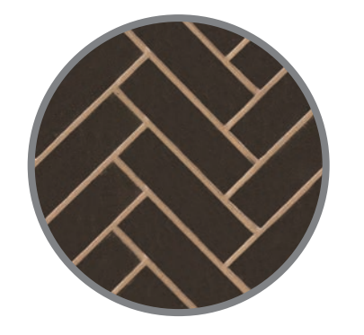
HERRINGBONE LINER Available for the E30, EX32, E33, EX35, & E44