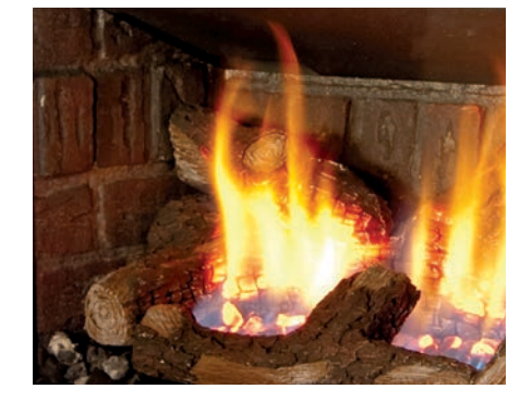
Brick Liner with Log Set