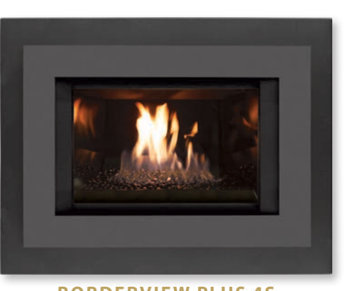
BORDERVIEW PLUS 4S Available for the E20, E30 & EX32 Powder Coated Grey