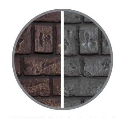
BRICK LINER (Original or Graphite Grey) Available for the Q1, E20, E30, EX32, E33, EX35, & E44 (Graphite Grey not available for the E20 or E44)