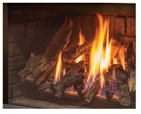
Traditional Log Set with Brick Liner