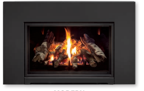
MODERN Available for the E20, E30, E33, & E44