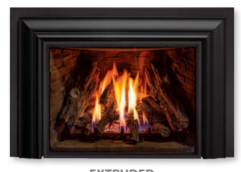
EXTRUDED Available for the E20, E30, E33, EX32, EX35, & E44