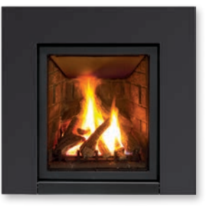
Q1 MODERN Available for the Q1