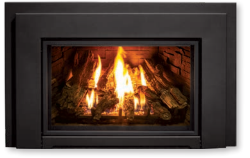
CONTEMPORARY Available for the E20, E30, E33, EX32, EX35, & E44