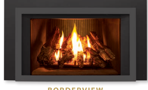
BORDERVIEW Available for the E20, E30, E33, EX32, EX35 Powder Coated Grey