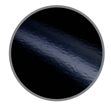
BLACK ENAMELED STEEL LINER Available for the Q1, E20, E30, EX32, E33, EX35,& E44