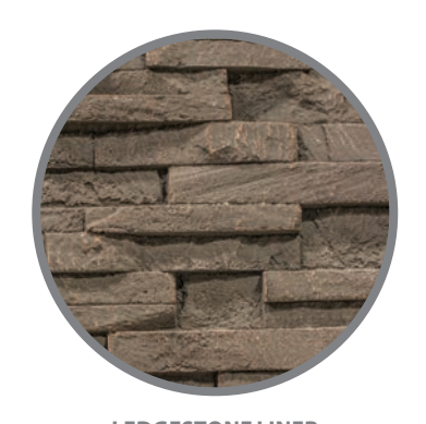
LEDGESTONE LINER Available for the Q1, E30, EX32, E33, EX35, & E44