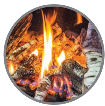
BIRCH LOG SET Available for the E30, E33, E44