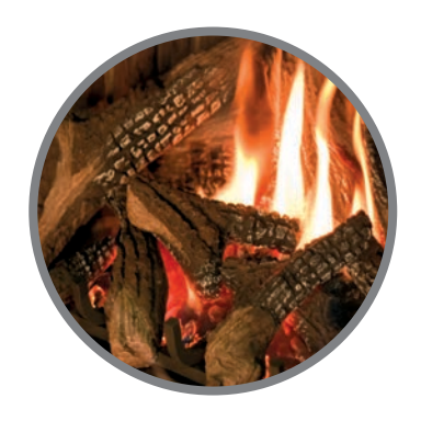
CLASSIC LOG SET Available for the Q1, E20