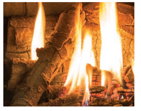
Ultra HD Log Set with Brick Liner