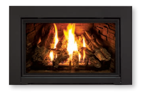
SLIM Available for the E20, E30, E33, EX32 & EX35