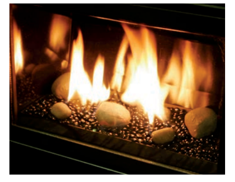
Black Glass with Decorative Stones