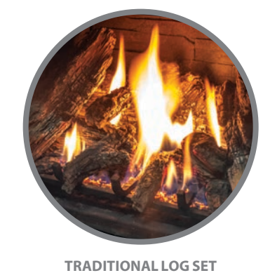
Available for the E30, E33, & E44