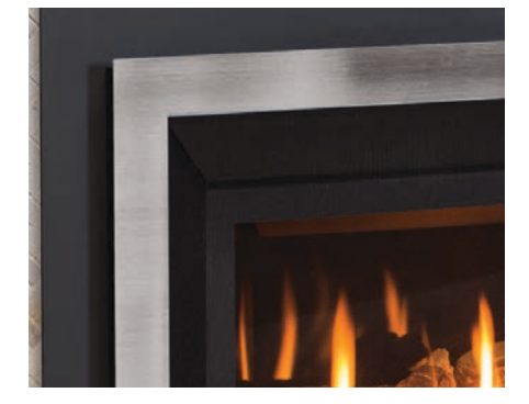
Designer Series Surround