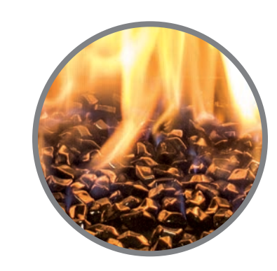
GLASS BURNER WITH DIAMOND GLASS Available for the E20, E30, E33, & Q1