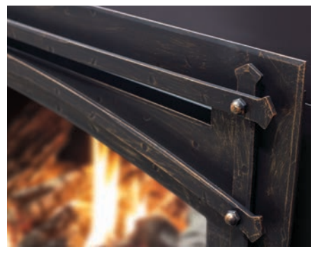
Midnight Bronze Forgeworks Surround