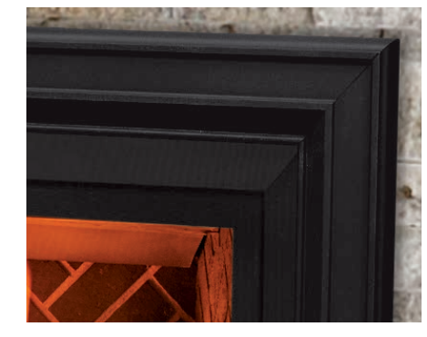
Cast Plus Surround