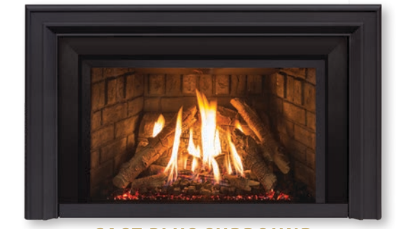
CAST PLUS SURROUND Available for the E30, E33, EX32 & EX35