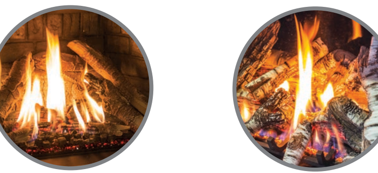
ULTRA HIGH DEFINITION LOG SET Available for the EX32, & EX35