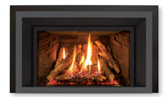
DESIGNER SERIES SURROUND Available for the E30, E33, EX32 & EX35 Brushed Nickel • Brushed Antique Copper • Powder Coated Grey Powder Coated Silver • Powder Coated Bronze