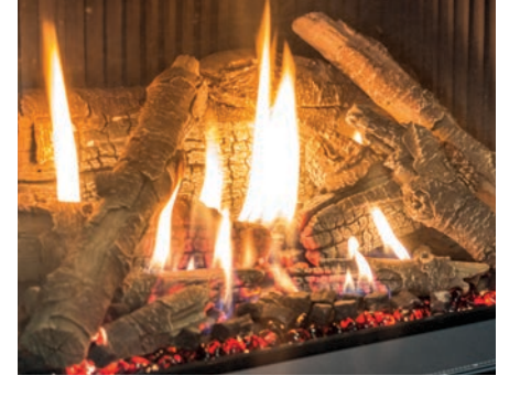
Ultra HD Log Set with Fluted Liner