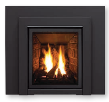
CONTEMPORARY W/TRIMMABLE PANEL Available for the Q1