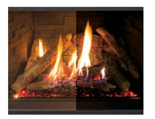
Firebox Top Lighting (Left=On, Right=Off)