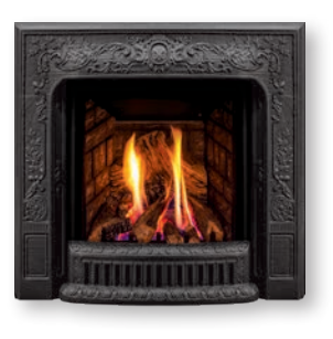
VICTORIAN FACE Available for the Q1 Painted Black or Antique Bronze Back panel can be removed