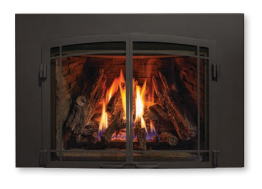
CAPE COD DOORS Available for the E44