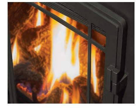
Cape Cod Doors