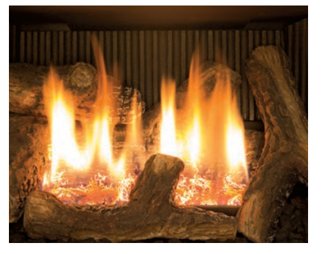
Fluted Liner with Log Set