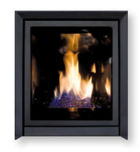
MINIMAL SURROUND Available for the Q1