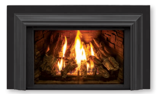
EXTRUDED PLUS Available for the E33 & EX35 Powder Coated Grey