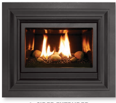
4 - SIDED EXTRUDED Available for the E20, E30, EX32 & E44