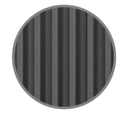
FLUTED LINER Available for the E20, E30, EX32, E33, EX35, & E44