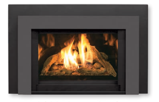
BORDERVIEW PLUS Available for the E30 & EX32 Powder Coated Grey