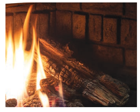
Brick Liner with Traditional Log Set