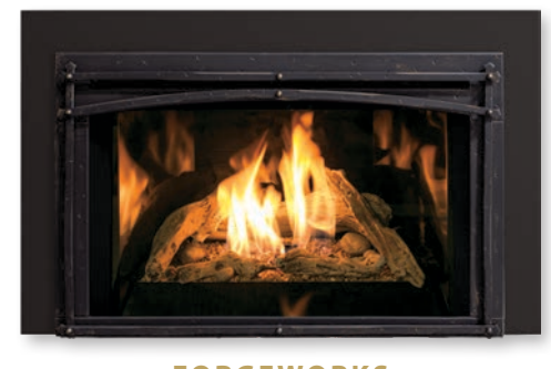
FORGEWORKS Available for the E30, E33, EX32 & EX35 Midnight Bronze